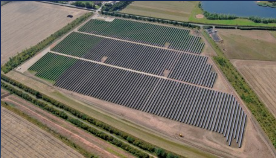
Lark Energy's 5MWp Solar Farm at Hawton, Newark

The picture above illustrates the relatively low visual impact of solar farms - please note that Lark Energy is not involved in wind farm developments.