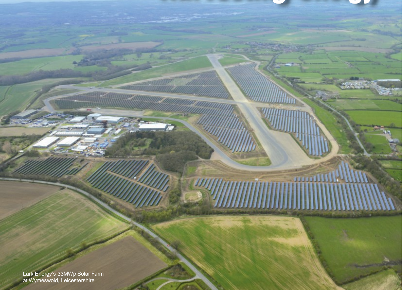
Lark Energy's 33MWp Solar Farm at Wymeswold, Leicestershire